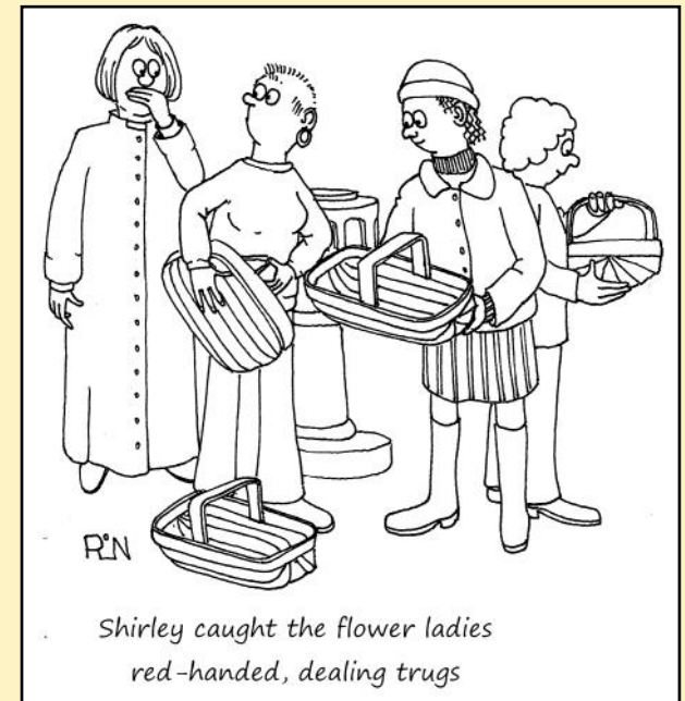
Shirley caught the flower ladies red-handed, dealing trugs